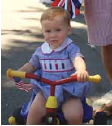
Parade Pedaling Participant