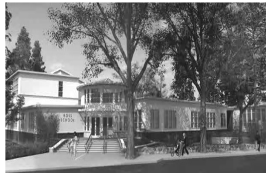
Proposed Design of Ross School

With a combination of public and private funding, we can complete our school renovation project, provide a safe environment for our children, and enhance our community for future generations.