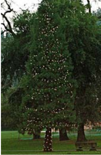
New Ross Tradition (pg 2)